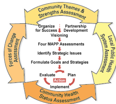
Figure 1: Key phases of the MAPP process

MAPP is a paradigm shift in how we think about public health planning. It is a shift from operational to strategic planning; from a focus on the agency to a focus on the community and the entire public health system; from needs assessment to an emphasis on assets and resources; from a medically or service-oriented model to a model that encompasses a broad definition of health; and from an "agency knows all" perspective to the belief that "everyone knows something."