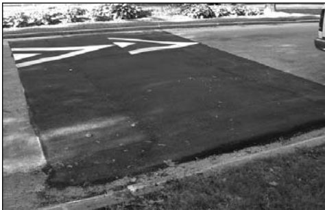
These speed humps were installed as an experiment on W. McKinley Blvd. from N. 27th St. to N. 35th St. Some of the rounded raised areas are also called speed tables or “vertical deflection” structures.

The measure would allow residents to petition the Common Council to have the traffic calming device installed on their street. Property owners along the street would pay an assessment. Contact Ald. Donovan at 286-3533 for more information.