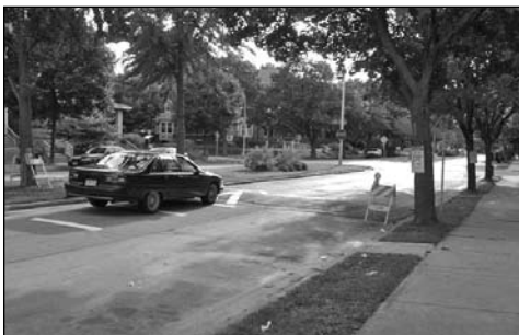
While many consider this traffic calming device appropriate for slowing street traffic and say it’s a relatively inexpensive device, others are concerned that they can interfere with emergency vehicles or create problems for people with certain disabilities.