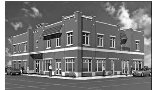
Construction is underway, and the Continental Bank branch is expected to be completed next March. The building will include retail tenants, residential apartments and a community room for neighborhood groups to use at no charge.

The Potawatomi Casino expansion is a $240 million project that will triple space at the Menomonee Valley casino and temporarily employ about 500 construction workers. When the expansion is completed in 2008, the tribe plans to hire an additional 1,000 full and part-time employees to add to the existing 2,000 staff members. The Forest County Potawatomi tribe paid the City of Milwaukee $4.2 million this year as part of a revenue-sharing deal, and the expansion is expected to increase revenue and the amount of that payment.