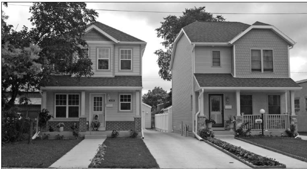
New homes on land that has been idle for years are important additions to the diverse housing stock and the effort to revitalize 8th District neighborhoods. These two homes in the 1600 block of S. 38th St. were built on land sold by the city to a private contractor.