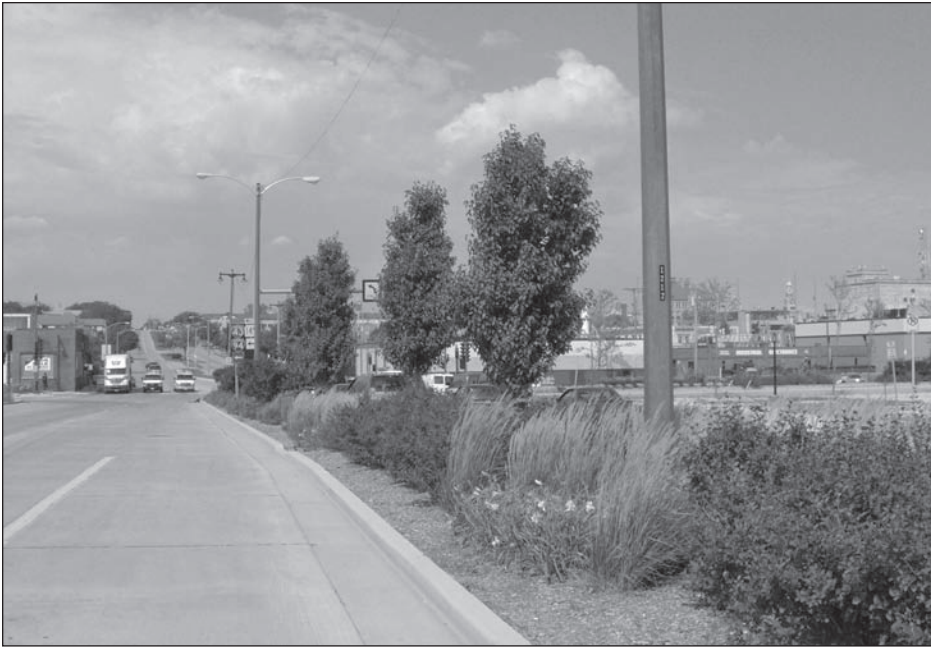
This boulevard – located at N. 6th St. and W. McKinley Blvd. – includes grasses, plants and trees that require far less maintenance and care by city Forestry employees.