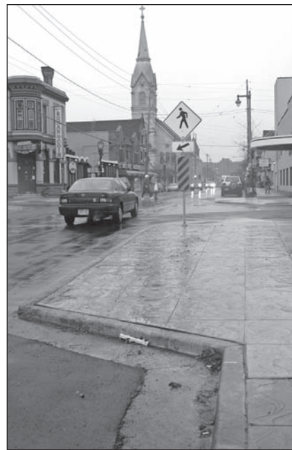
Left - Speed hump installation on McKinley Blvd. between 27th and 35th Streets. Right - Typical curb bump out installation on Brady Street.