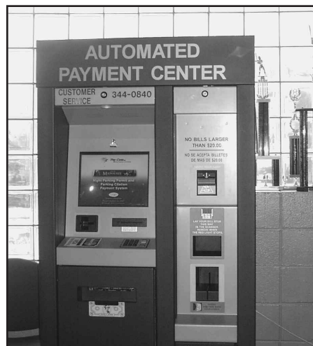
Automated payment machine in Police District 6.

The City Milwaukee sells over 190,000 night parking permits annually. The payment centers will make the purchase of night parking permits more convenient. The payment centers, which are currently located at Police Districts 2, 5, and 6 are available 24 hours a day, seven days a week. They take cash, check or credit card, and are in both English and Spanish. If a resident has purchased a permit in the last 12 months, the permit information will appear on the screen and all the resident has to do is update the information, if necessary. If a resident has never purchased a permit, he or she can apply at the payment center as well.