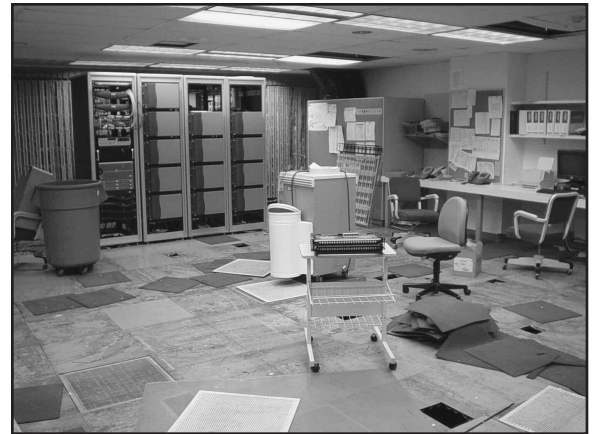
The new "telephone corner".

cabinets. The new equipment only takes up only 4 19 inch wide racks less than 1/10th the space of the ROLM equipment. The new telephone system and open source software enable the computer telephony integration needed to build the Mayor's "One Number to Call" initiative 286-CITY and integration with the DPW Call Center application.