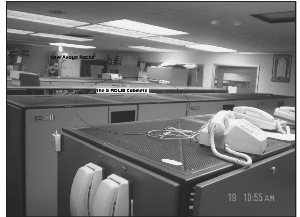
The old telephone room took up considerable more space.

Good for the future is another story. When we turned off the old ROLM telephone system in the City Hall complex the power consumption dropped from 400 to 70 amps. An 82 percent reduction in electrical consumption for the telephone system. There will also be a corresponding savings in air-conditioning required for the "telephone room". Actually it is more like a telephone corner not a telephone room. The ROLM cabinets were 48 inches wide and 30 inches deep, there were 3 cabinets bolted together in a row and there were 5 rows of these cabinets for a total of 15