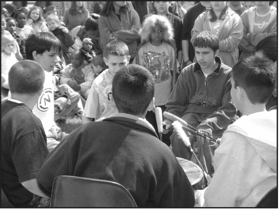
Young men from the Indian Community School perform an "honoring of the land" ceremony as part of the City's 40th Arbor Day celebration